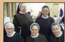
Franciscan Sisters of the Immaculate Conception