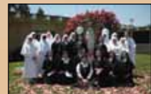
Servants of Mary—Ministers of the Sick, Oxnard, CA