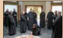
Benedictines of Prince of Peace Abbey, Oceanside, CA