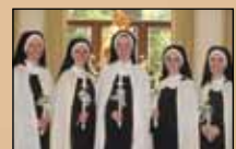
Carmelite Sisters of the Divine Heart of Jesus, La Mesa, CA