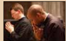
Oblates of the Virgin Mary, Boston, MA