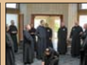
Monks of Prince of Peace Abbey, Oceanside, CA