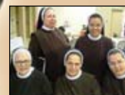
Franciscan Sisters of the Immaculate Conception, San Fernando, CA