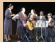
Poor Clare Missionary Sisters of the Most Blessed Sacrament, Santa Ana, CA