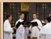
Nobertine Fathers of St. Michael's Abbey, Silverado, CA