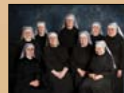
Little Sisters of the Poor, San Pedro, CA