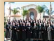
Servants of Mary, Ministers of the Sick, Los Angeles, CA