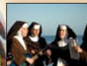
The Carmelite Sisters of the Most Sacred Heart of Jesus, Alhambra, CA