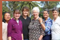
Fr. Kolbe Missionaries of the Immaculata West Covina, CA