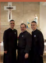
Fathers of Mercy, Auburn, KY