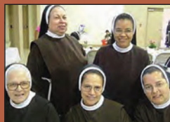
Franciscan Sisters of the Immaculate Conception, Sylmar, CA