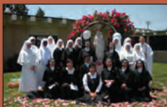
Servants of Mary, Ministers of the Sick, Los Angeles, CA