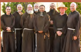
Capuchin Franciscans, Western American Province