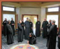
Benedictine Monks of Prince of Peace Abbey, Oceanside, CA